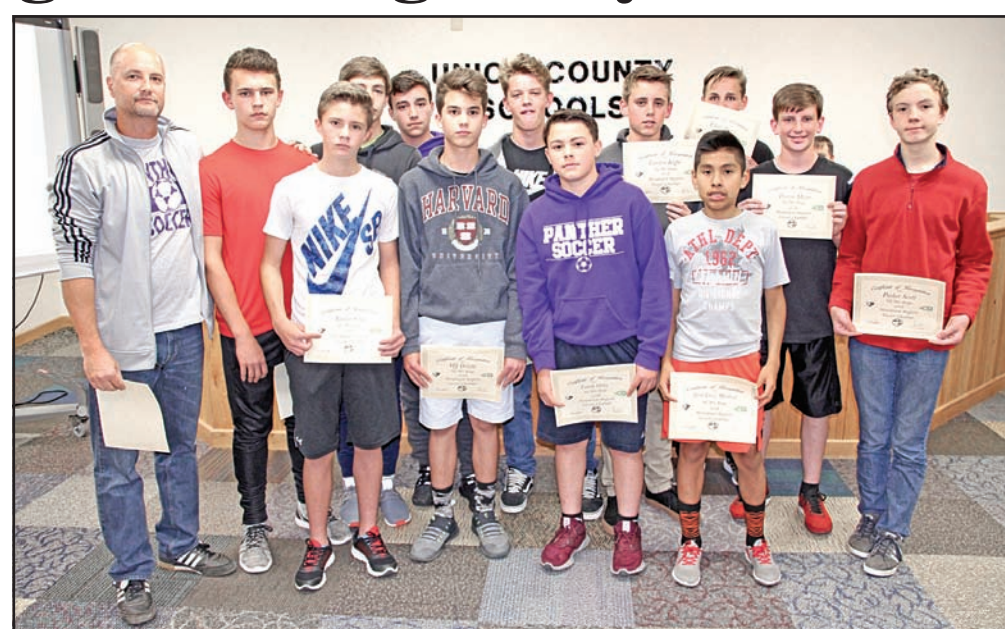
The Union County Middle School boys' soccer team received recognition for their stellar season in the April BOE meeting.